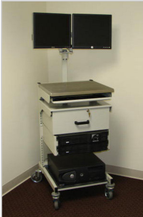
MWC Cart with MIMWC-60142-GY; Rack Mount Extender Kit