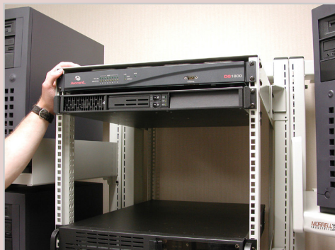
Above, LO3000 Workstation shown with MILTS-57002-XX; 19" Rack Add-on

Morrell Industries offers a wide range of 19" Rack Mount options. Integrate a variety of these space saving solutions into your Network and Server Rooms. Standard components allow you to easily adapt and expand your existing work environments.